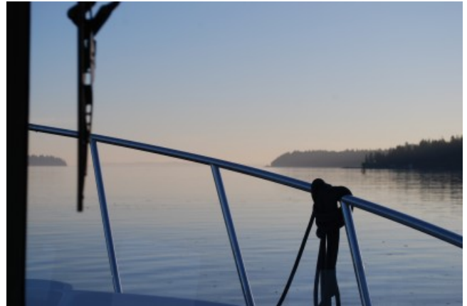
Early morning up Colvos Passage