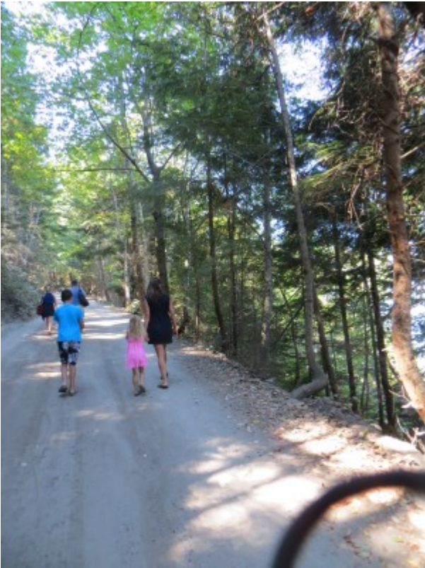
Dirt roads on Savory