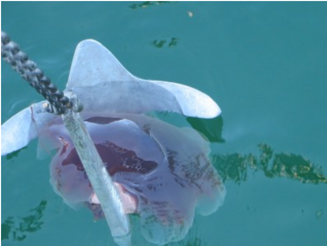
Giant Jellyfish came up with the anchor

After the nice sunset, a few boats across the waterway started getting super rowdy. Loud music, yelling and screaming at each other with words I cannot repeat, and being downwind from them didn't help. "Dad what's that smell?" "Well son that's what ya call the marijuana" So much so I think we all got a little high! 3am they finally quieted down and we were able to fall asleep.