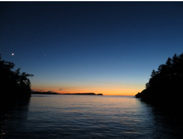
Sunset from Matia