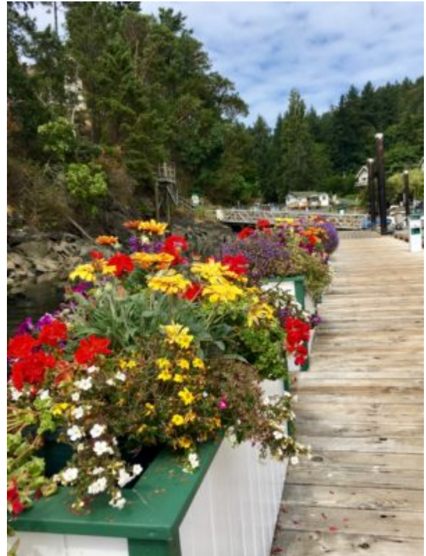
Otter Bay docks