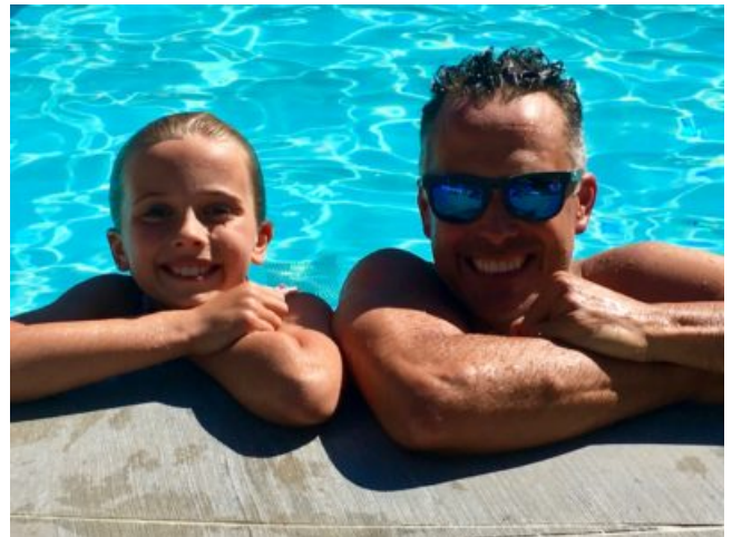
Fun in the pool