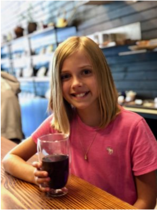
o5 Tea. What a fun experience