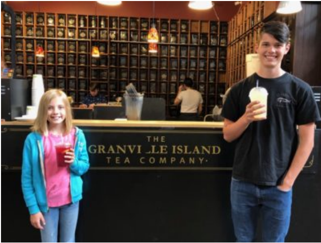
And a 3rd tea place. I guess our kids like tea