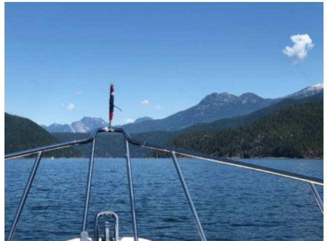
Time to swim in the warm water!