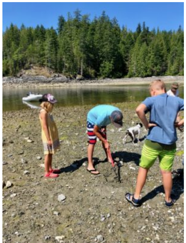
On the way to the falls we stopped to do some clamming