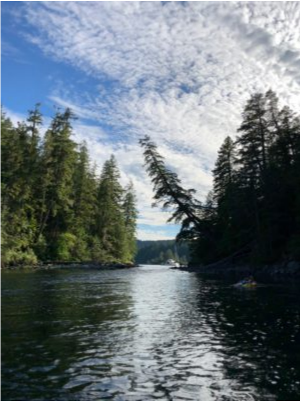
The rapids from a distance