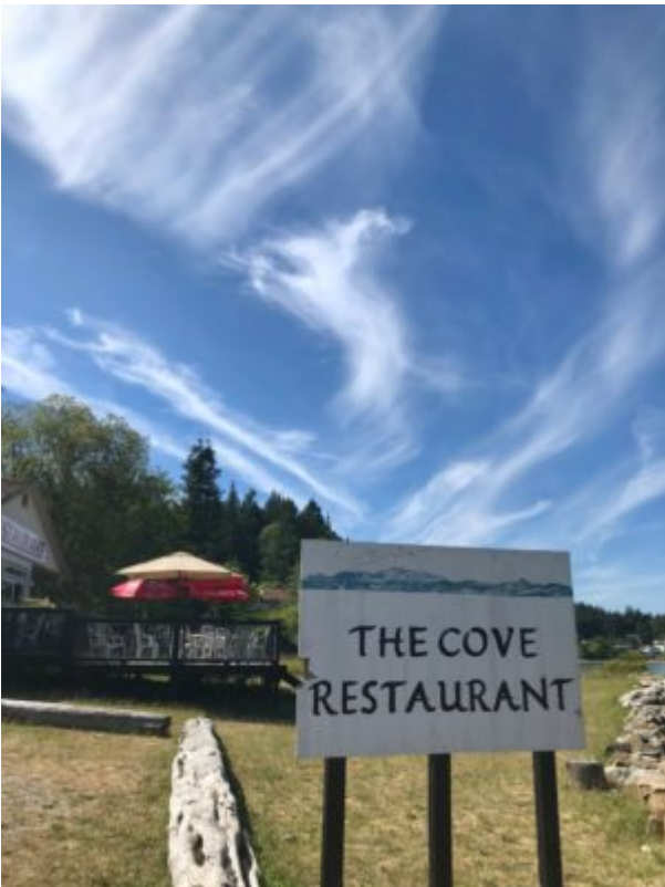
Restaurant is a strong word for this establishment