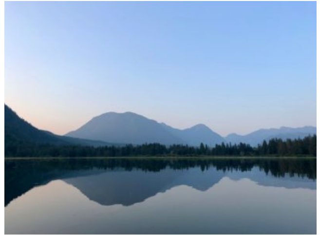
The large Lagoon