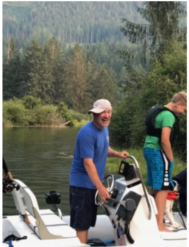
Total Bayou Redneck