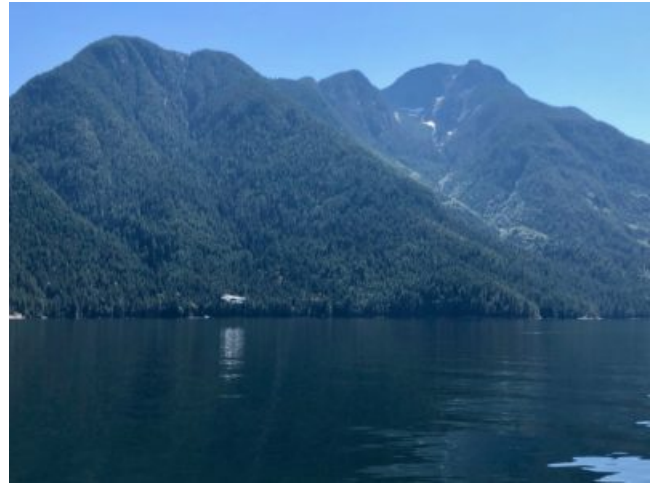
Yep, thats snow up there. And 90 degrees on the water.