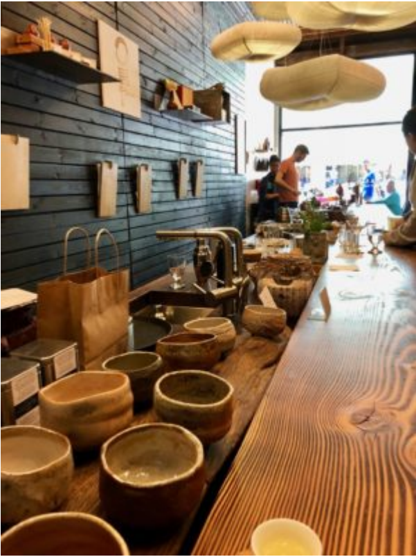
o5 Tea. What a fun experience