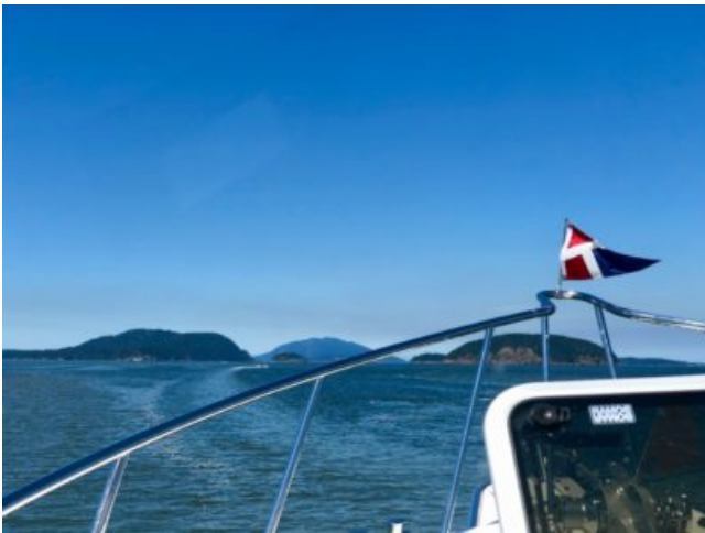
Rosario Strait on a calm day