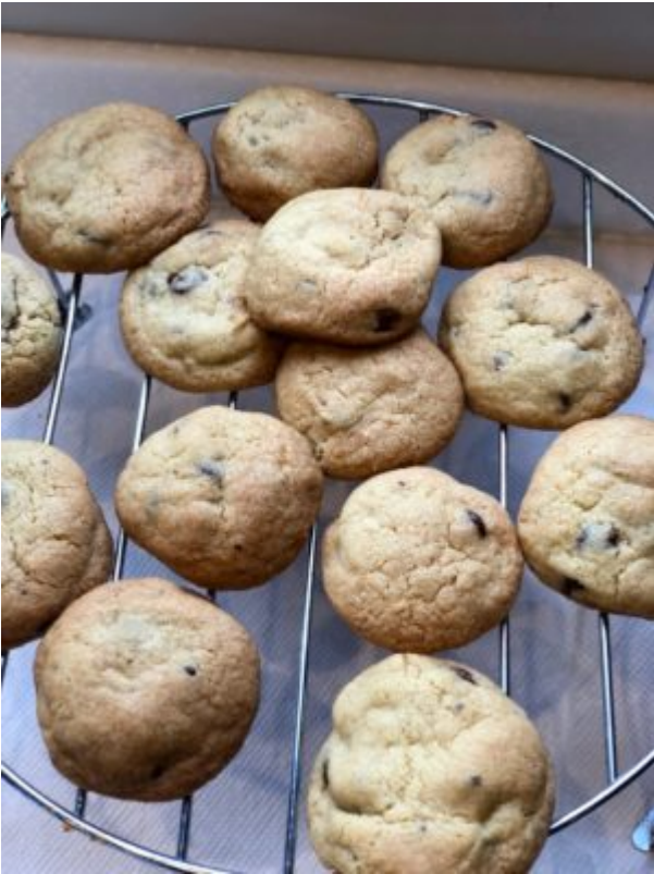
Cookies for a rainy evening!