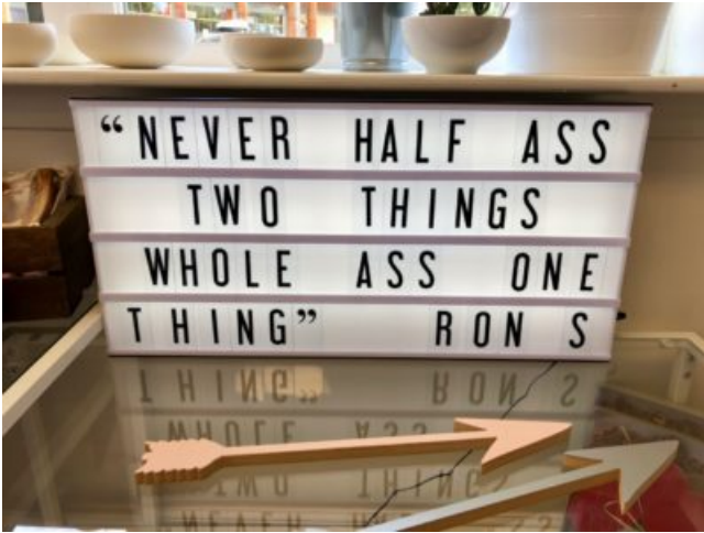
Wise words to live by