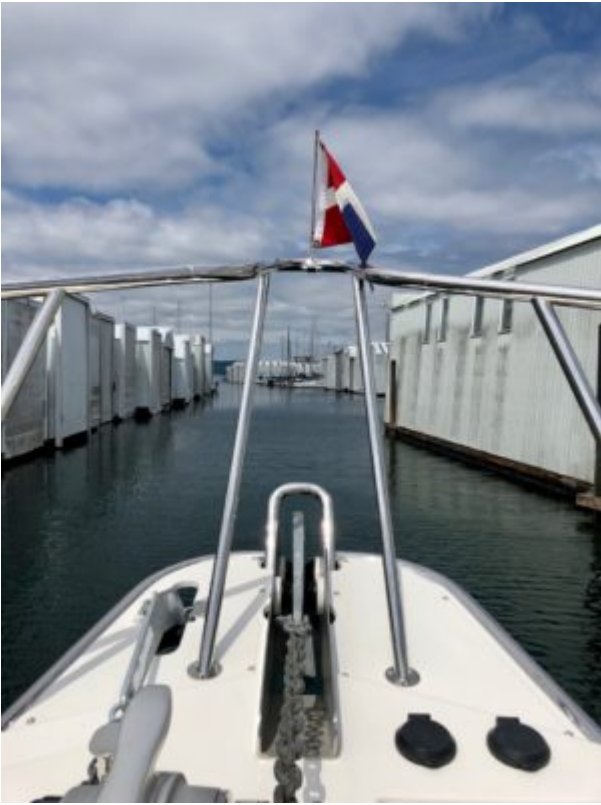
Leaving Tacoma Yacht Club