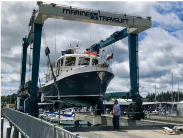
The haul out