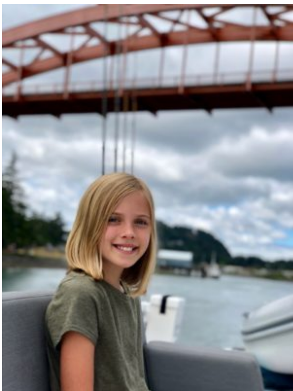
Arriving in La Conner

What a fantastic place, we couldn't believe we haven't been here before. We were the only boat in the anchorage and it was beautiful. After some exploring in the dinghy and beachcombing we cooked dinner on the boat then settled in for the night. More exploring tomorrow.