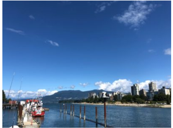
View from the fuel dock