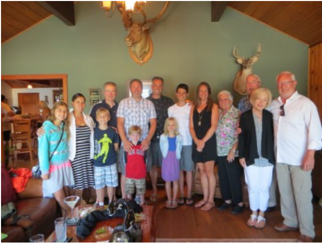
The whole crew