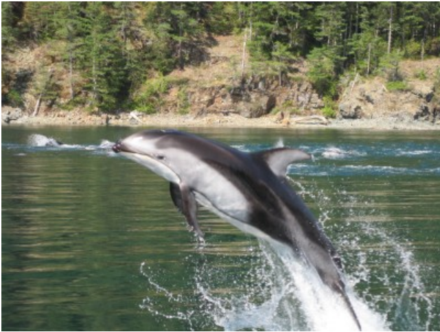
This picture was an accident! Todd was trying to get the dolphins in the background and this guy photo bombed the picture!