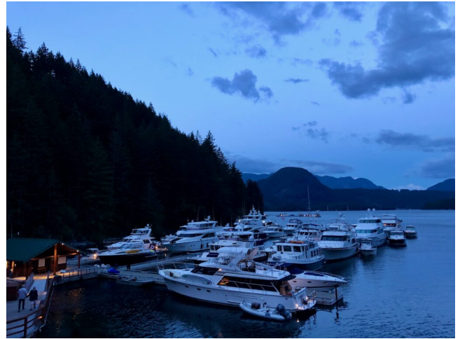
Docks at Dent Island