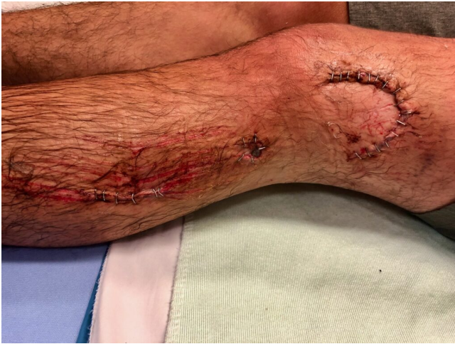
All stitched up