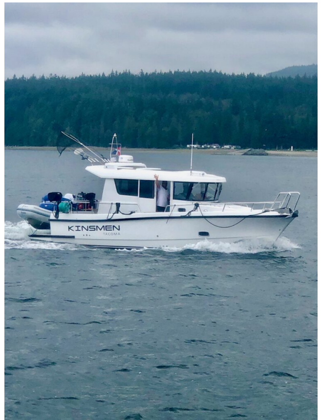
The boat that saved us