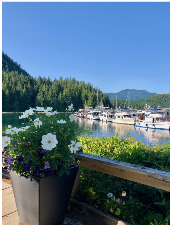
Blind Channel Marina