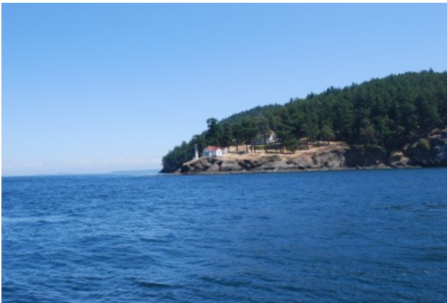
Turn Point on Stewart Island