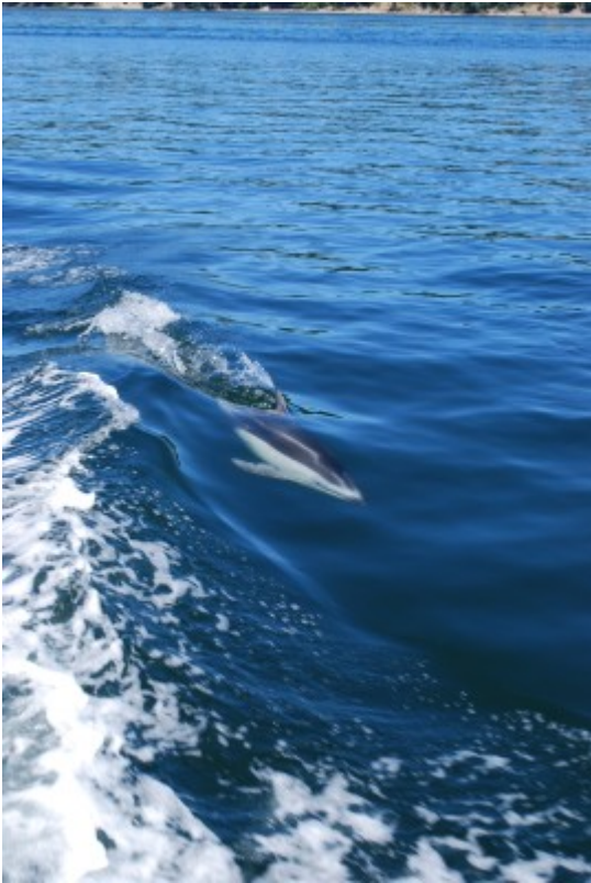
Pacific White Sided Dolphin playing in our wake