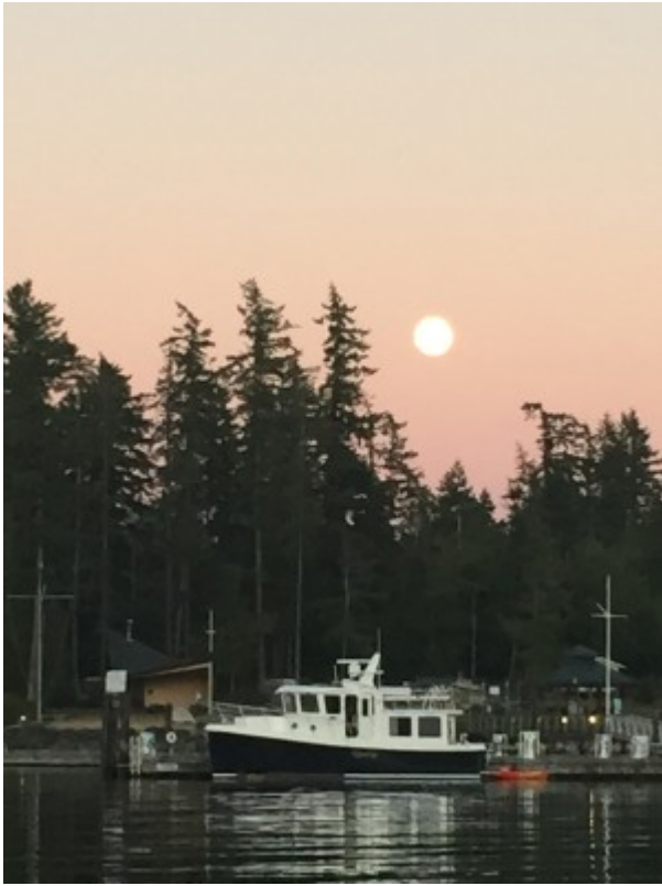
Thats the moon rising over our boat