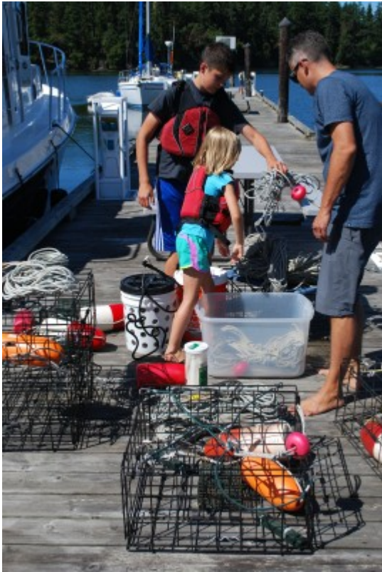
Getting ready for crabbing