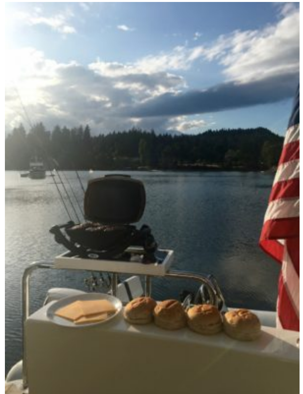
Hamburgers for dinner