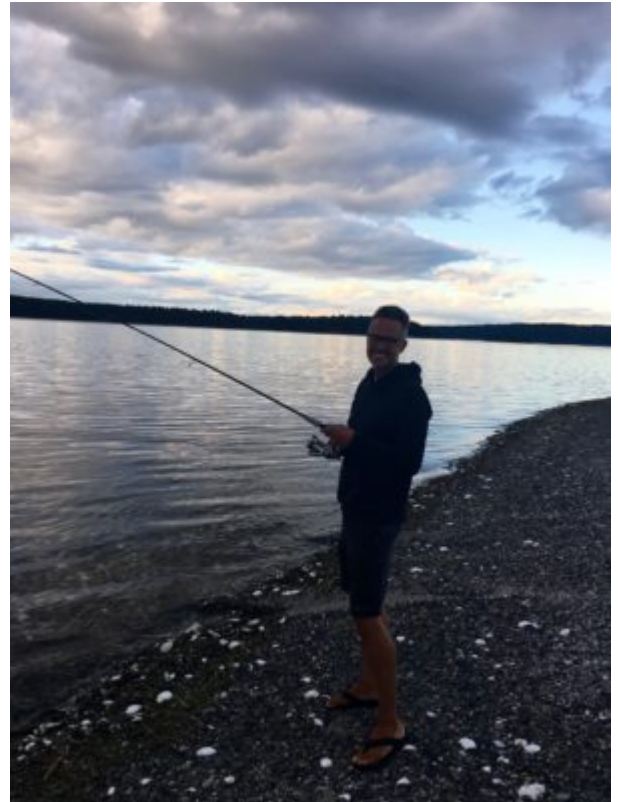
No fish at Clam Bay