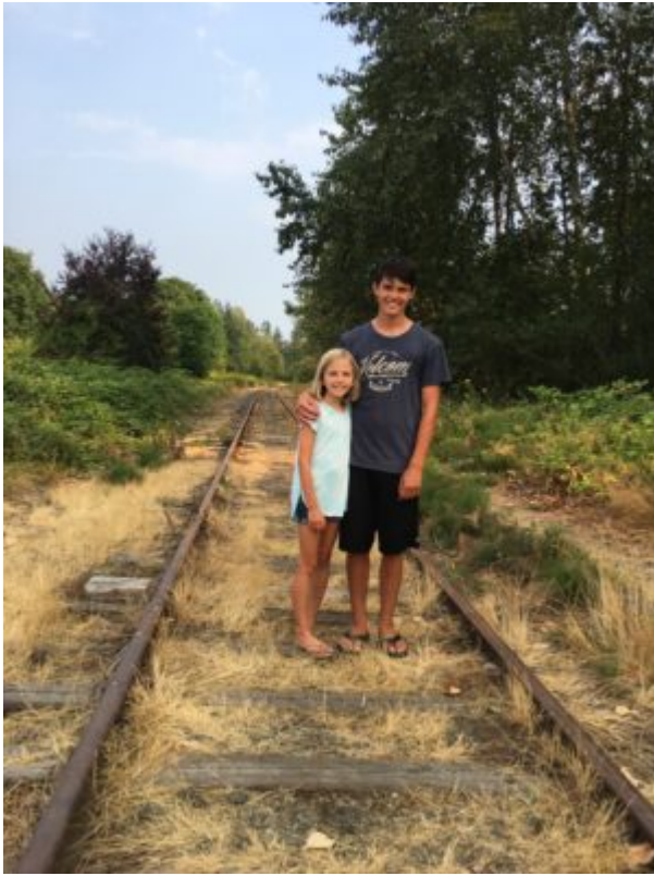
Our walk up the hill to Ladysmith