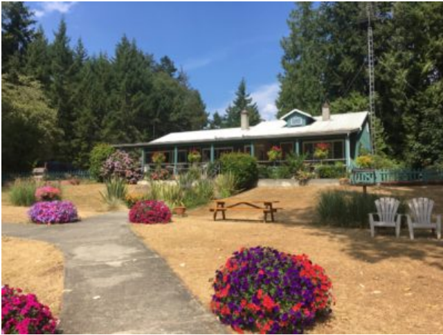
Telegraph Harbor Marina