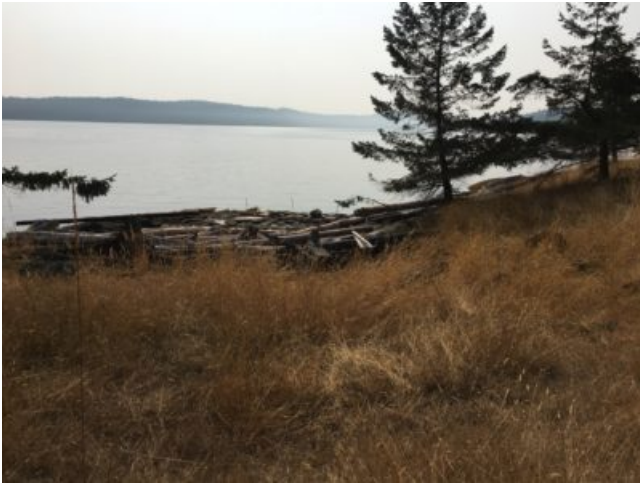
Moring hike, still smoky!