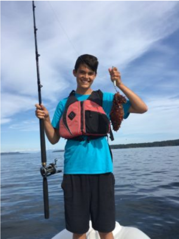
At least he got a sea cucumber