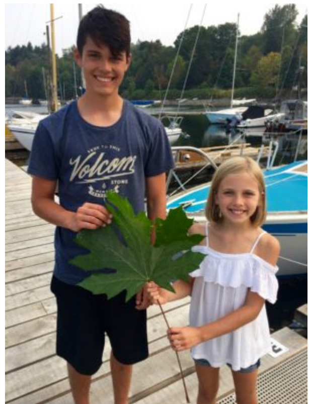
Kids showing their Canadian pride