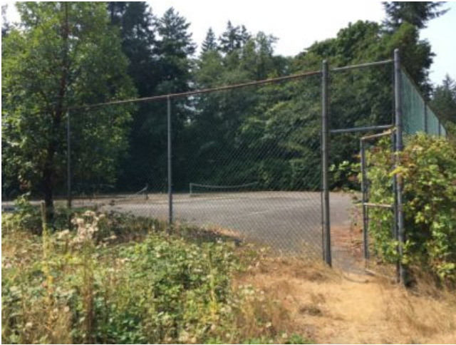
Blackberries surrounding the tennis court