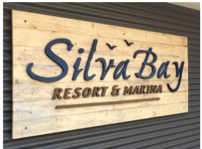
Marina? maybe. Resort? not so much