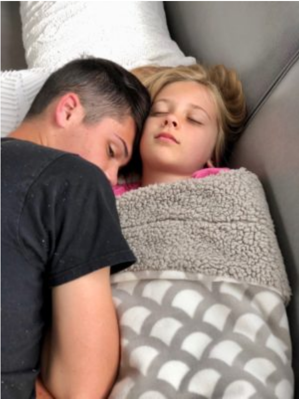
They still snuggle! at least for a while, then they fight.