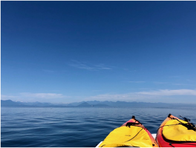
Smooth water crossing the strait