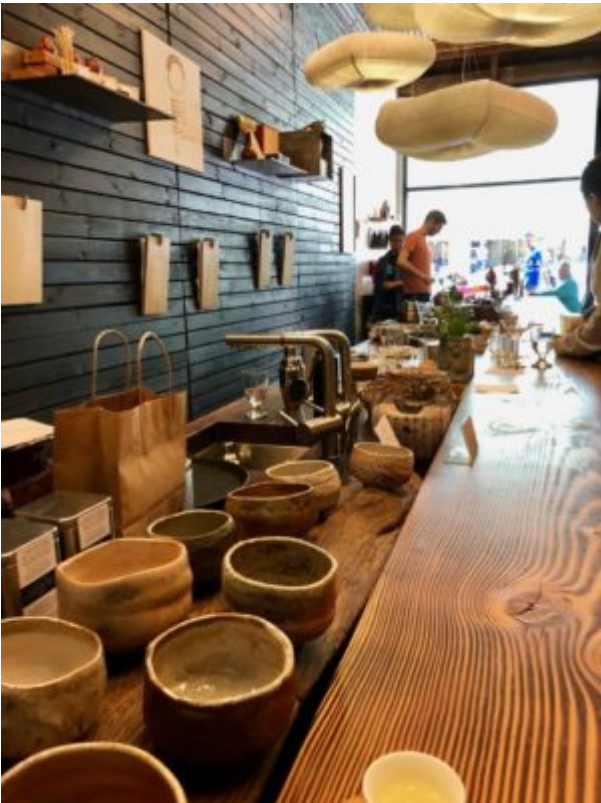
o5 Tea. What a fun