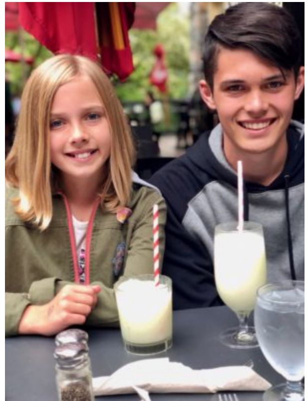
Lunch in the park