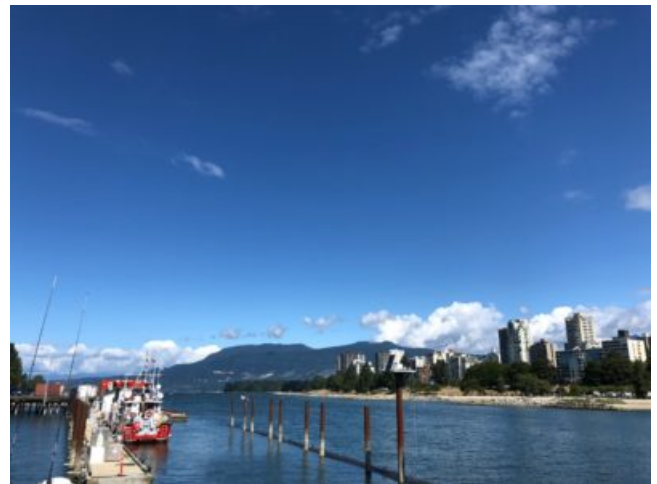
View from the fuel dock