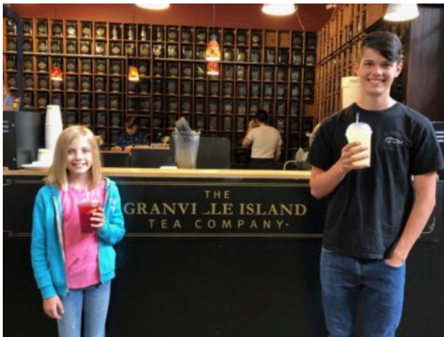
And a 3rd tea place. I guess our kids like tea