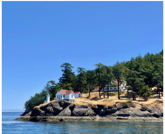
Turn Point, Stewart Island