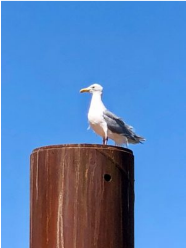
The lone Seagull