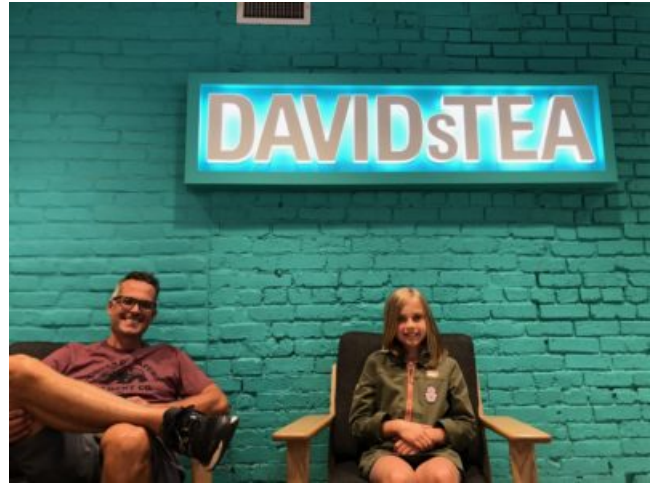
A different tea place, not as fancy