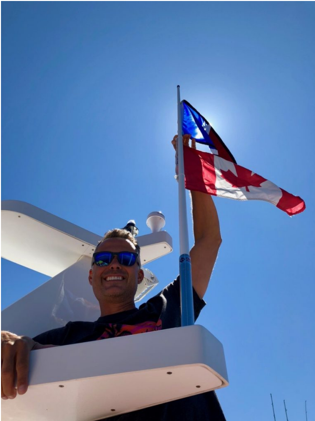
Time to raise the Canada flag!