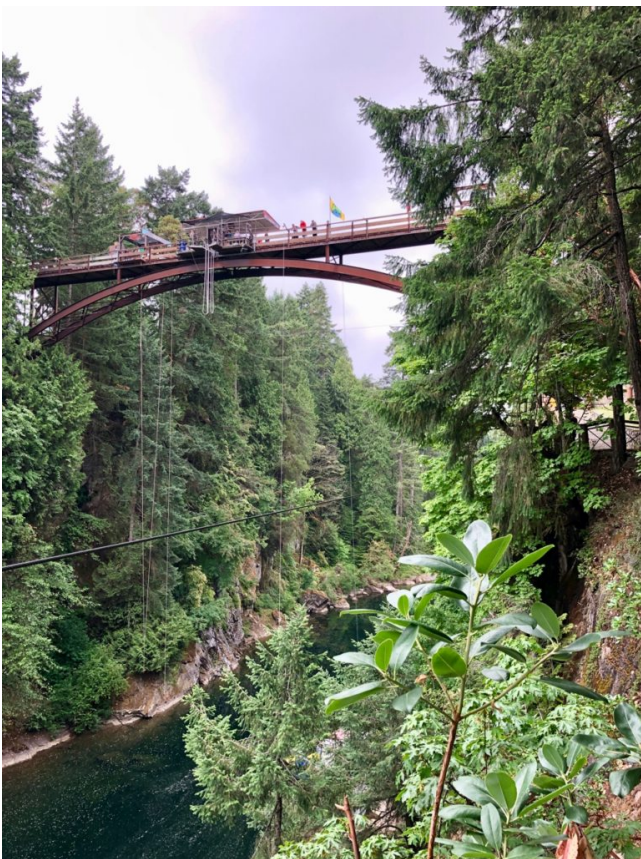
This is the bridge where the swing takes off from