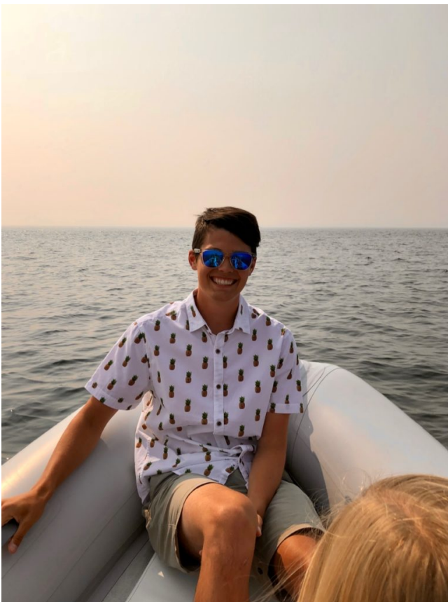
On our way to dinner in Sidney