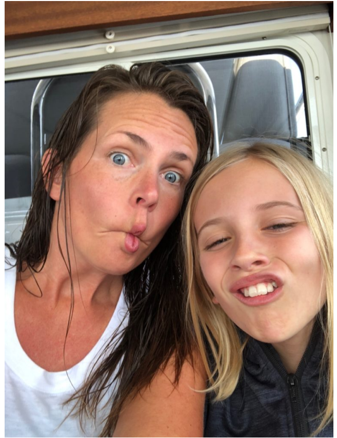
Our beautiful family