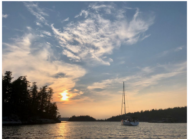
Sunset from our anchorage