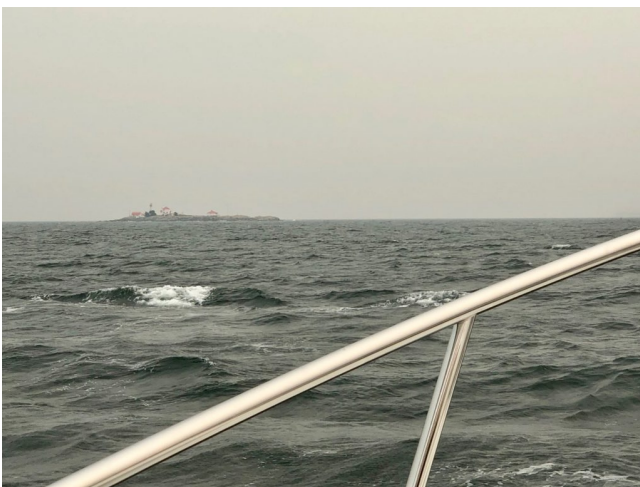
Long run down the Georgia Strait

In all we cruised 120nm in one day, an all-time record for us. We anchored off the spit and spent the next 2 nights just relaxing on the beach, watching the Orca whales pass by and taking the dinghy to dinner in Sidney.