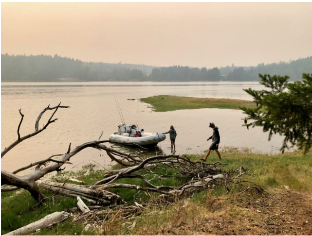
We took a trip to check out some friends property on Henry Island.