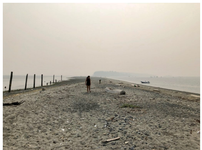
Sidney Spit in the smoke