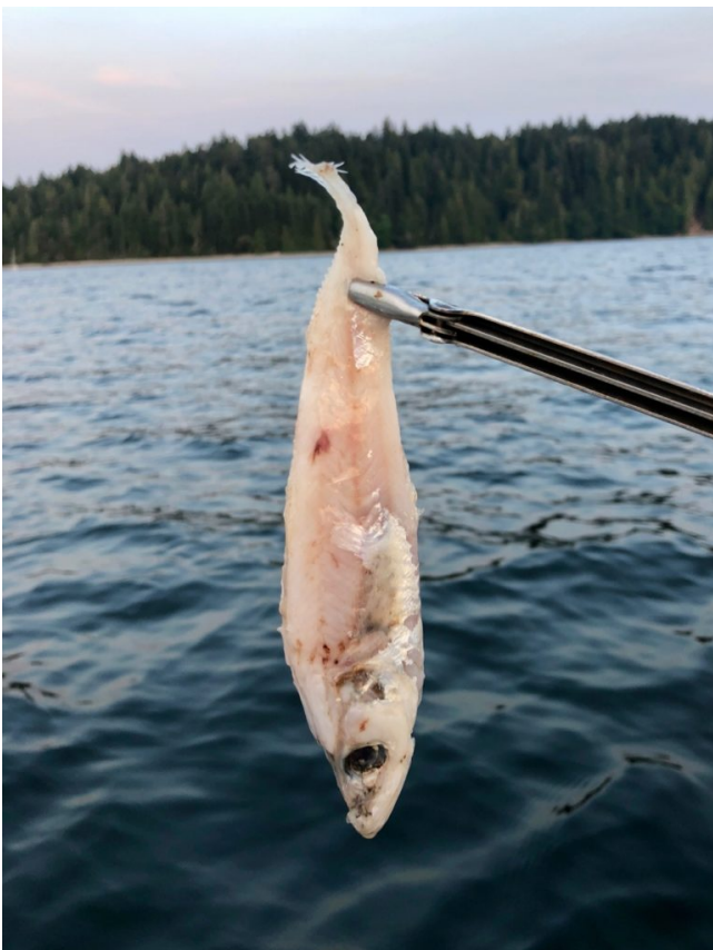
The ling puked this zombie