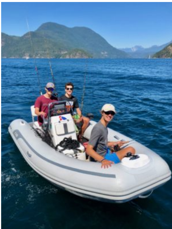
Leaving to do some fishing

We fished for a bit on the way back then pulled anchor and took off for Tenedos.