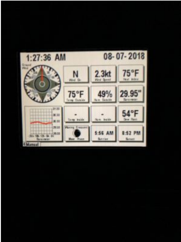
Notice the time, 1:27am and its still 75 degrees outside