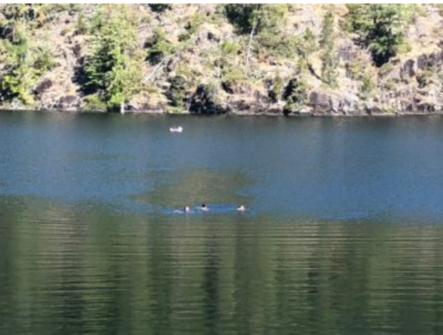
Kids swimming in the lake above the falls