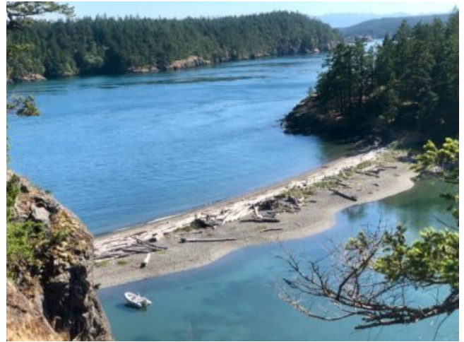
That's our dinghy down into the left hand corner