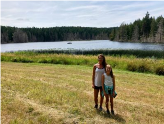
Roche Harbor Lake