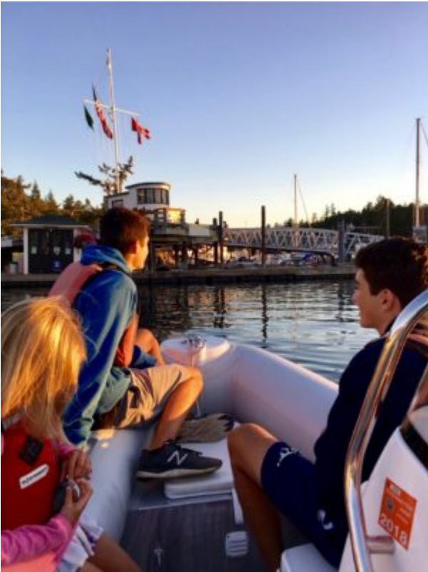
On the dinghy watching Colors