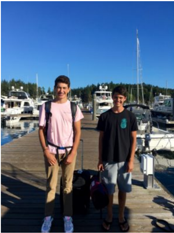
He made it!