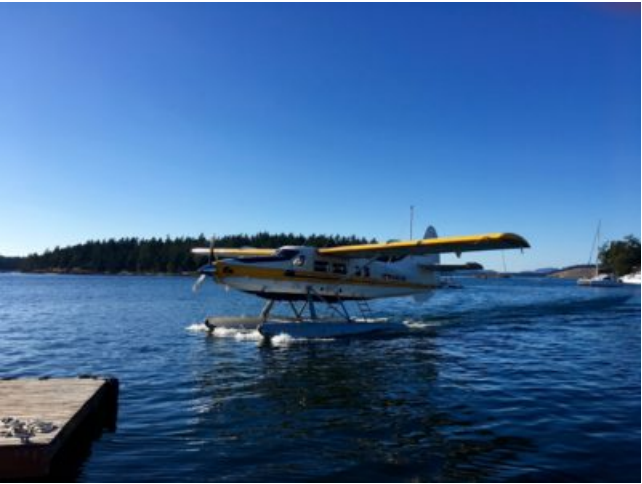
Johnny's float plane coming in