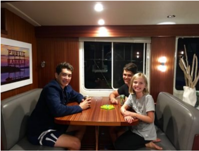
Kids playing Trouble