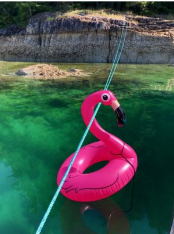
Fiona the flamingo stays put hanging by her neck.

Over the next couple days, we all had a blast. One minute you are swimming and the next you are pulling up a shrimp pot with dinner. Fishing, shrimping, picking huckleberries, swimming, wakeboarding, rope swing into the water, hiking, kayaking, paddle boarding, all in one location makes for a really fun place to be!