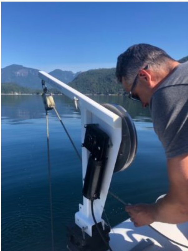
Pullin up the shrimp pots