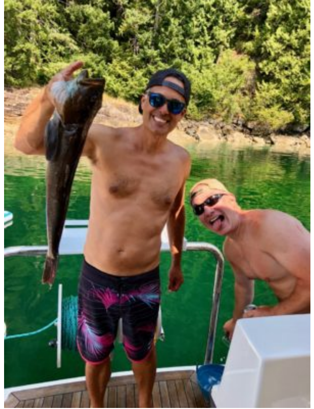
We got dinner!