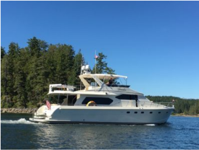
The Steel's on their way in to Grace Harbor