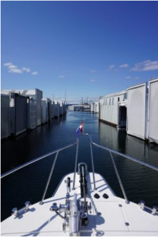
Leaving the yacht club