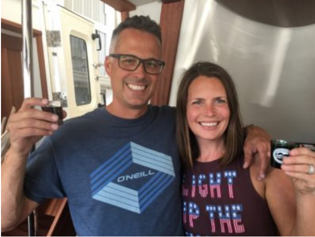
A celebration shot to kick off the cruise

to make it to the northern San Juan Islands. Reluctantly, I agreed to a 5:30am departure that would get us to Stewart Island by 3pm.