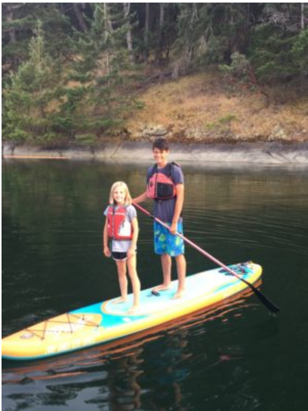
Still having fun together