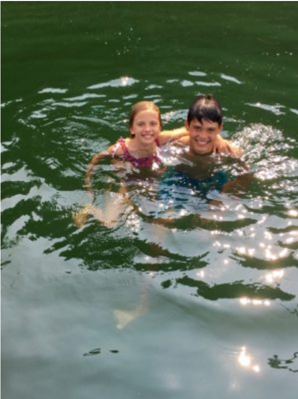
Kids having fun together