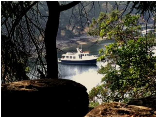
Our boat from the hike