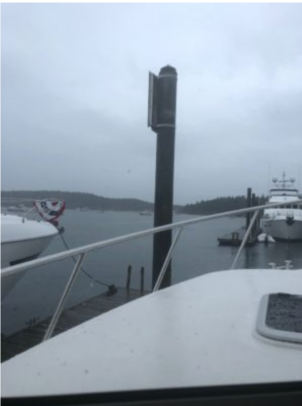
The rain coming down right as we left our slip

We had a nice time meeting up with some friends who were staying at the Seattle Yacht Club docks, then at 10:30pm the show started. The fireworks barge was right in front of our boat. It was incredible, we sat on top of our boat with an unobstructed view of a long, loud and brightly lit show. Super fun and a great way to celebrate Independence Day!