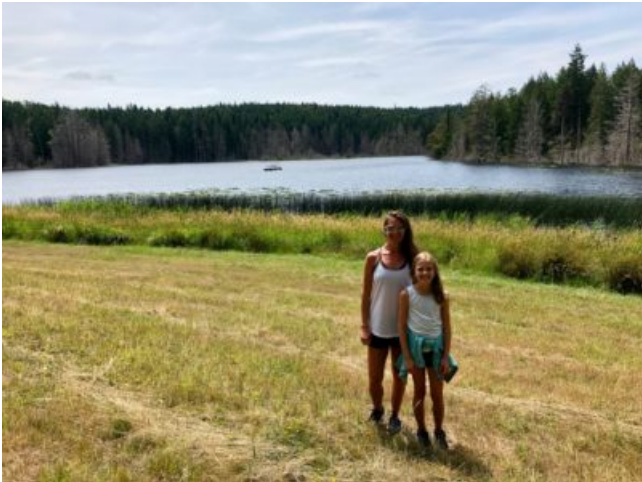
Roche Harbor Lake