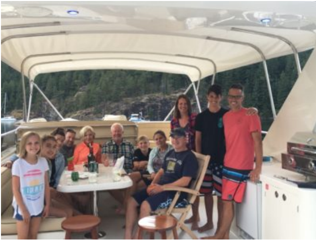
Birthday dinner with everyone