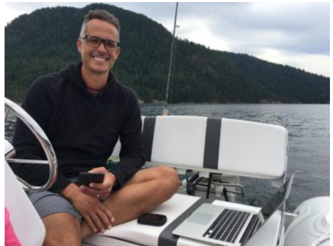
The only place to get cell service was out in the dinghy