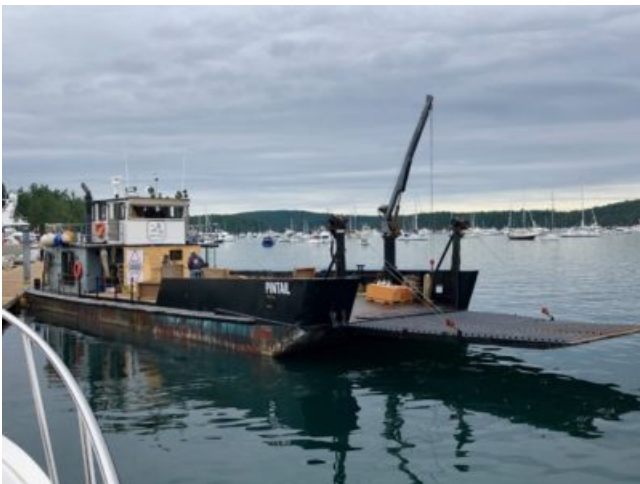
The fireworks boat left the dock right in front of us

We hadn't cleared customs yet and never have in Nanaimo, so we searched for the customs dock which ended up being full of boats. The fuel dock was right next to customs and the nice customs agent at the dock allowed us to clear customs there and fuel up at the same time. Once cleared, we made our way to our assigned slip in the Port Authority Marina. The weather continued to suck (and the 10-day forecast wasn't any better) so we decided to stay 2 nights in Nanaimo.