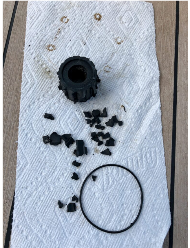
Destroyed generator impeller