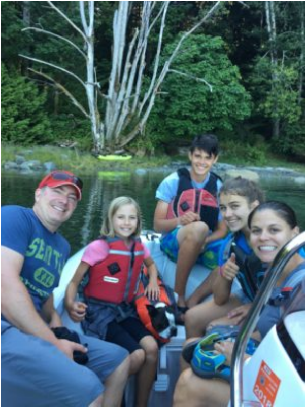
All of us riding back to the boat after the hike