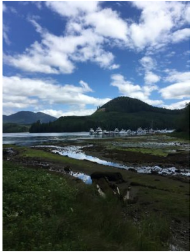
View of the channel from our hike