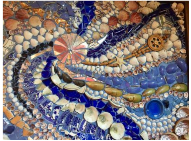
Dozens of interesting mosaics decorate the resort