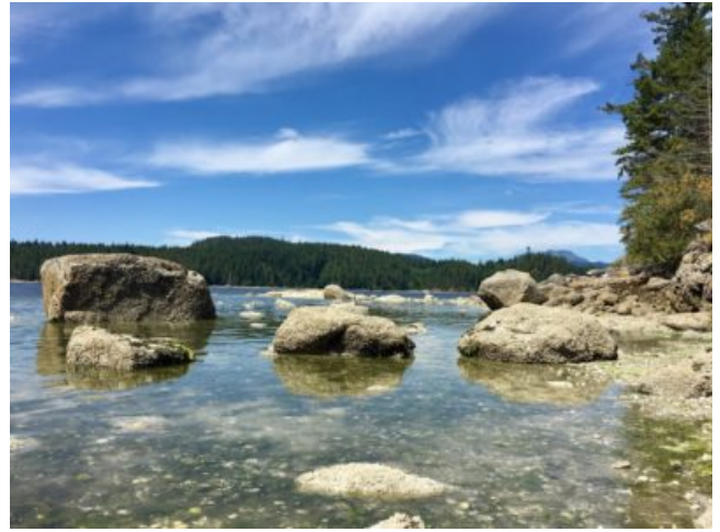
A beach in Octopus Islands