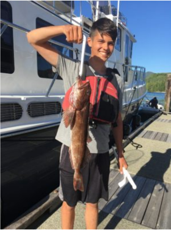
One of our Lingcod