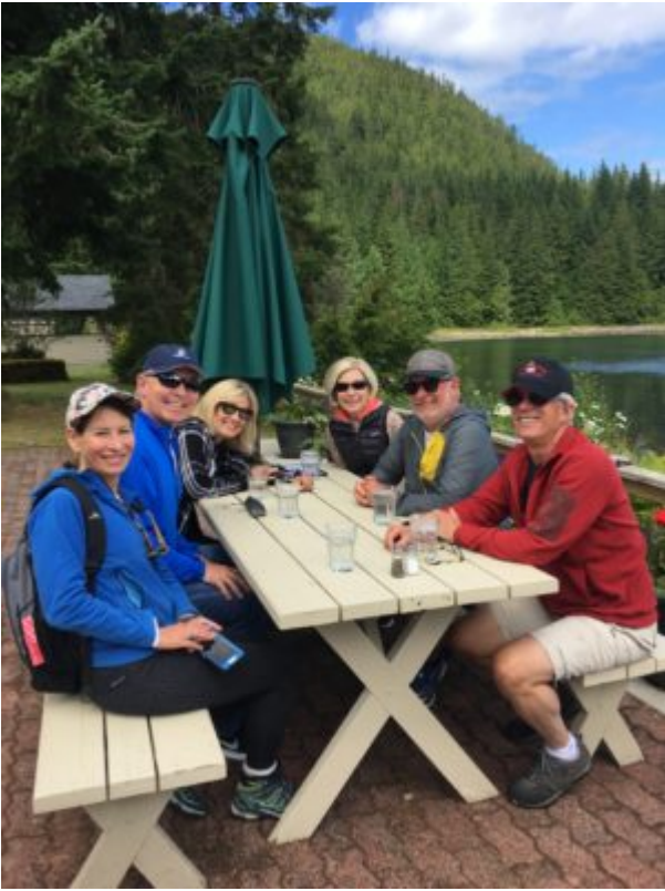
Lunch at Blind Channel