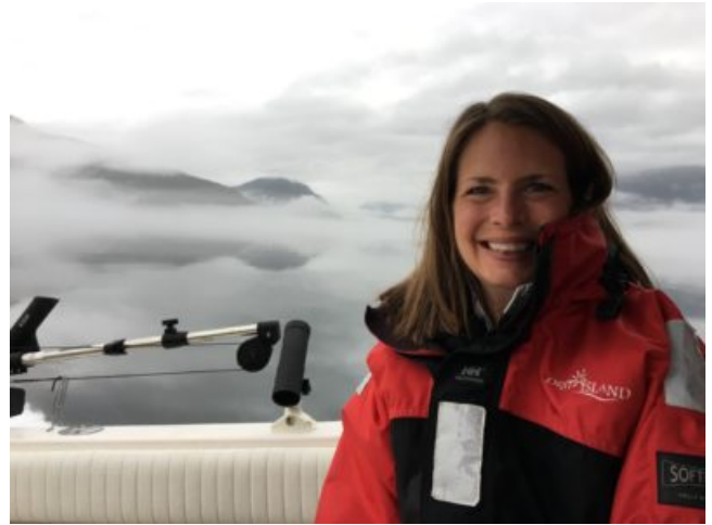
A foggy morning fishing