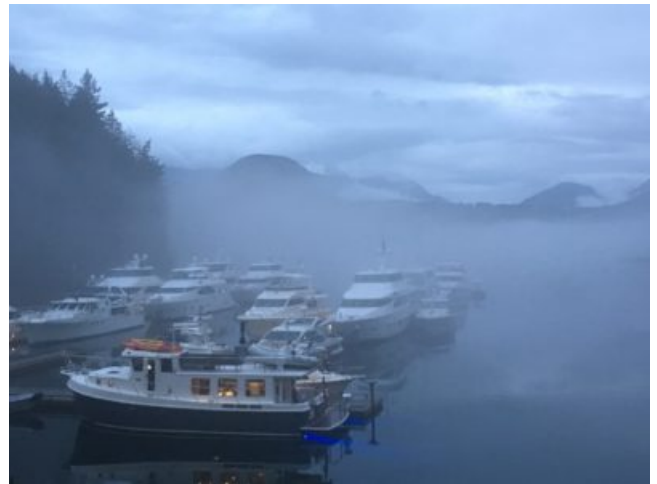
Dent Island dock in the fog