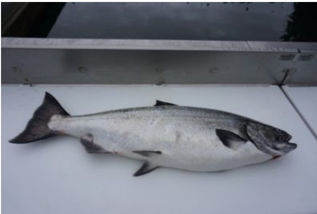
Skylars on the board for the Tye Club