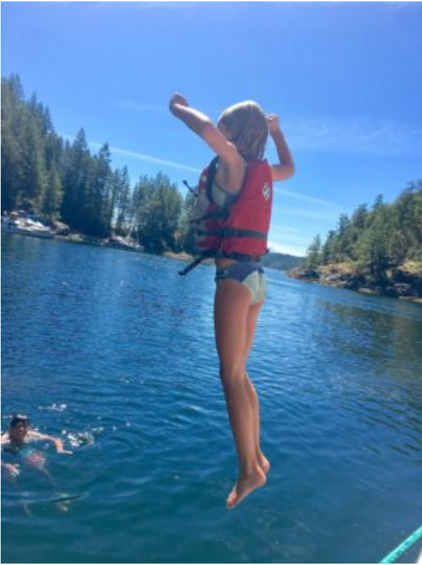
Jumping off the boat.