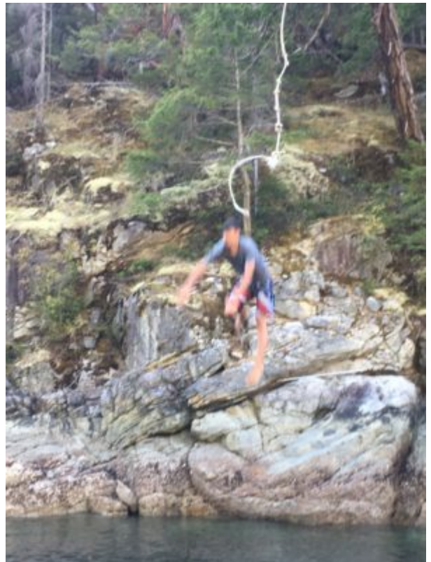
his epic fail!