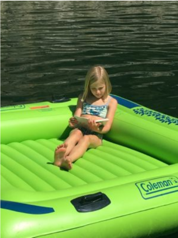
Our little reader!