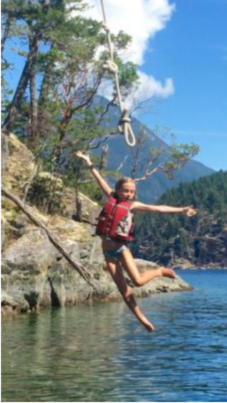
Awesome rope swing moment.