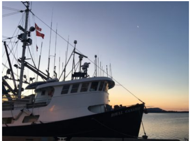
We shared the dock with this commercial vessel