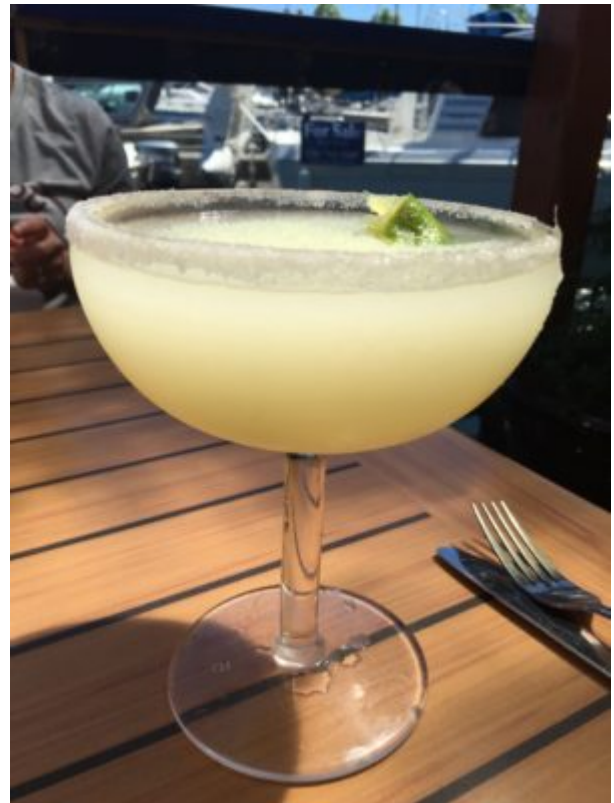
Margaritas for lunch!